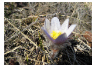
The big and small at the Clayhurst Reserve